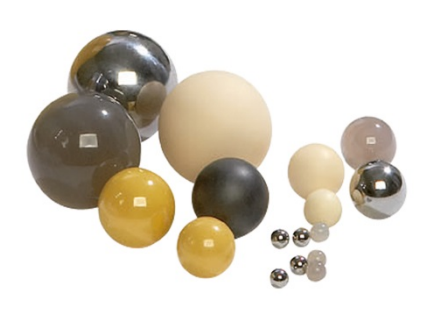
Fig. 2: Grinding bowl and grinding balls for Planetary Micro Mill PULVERISETTE 7 premium line

Author: Dipl. Phys. Wolfgang Simon, Fritsch GmbH,