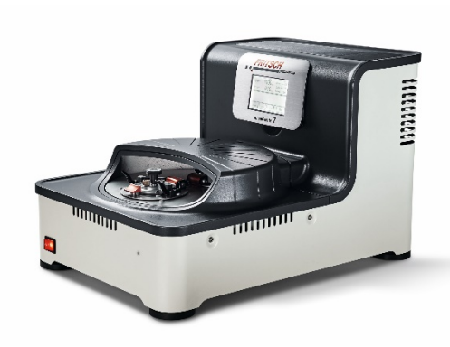
Fig. 1: Grinding bowls and balls for Planetary Mill PULVERISETTE 7 premium line

In a planetary mill, the sample is placed inside a grinding bowl along with the grinding balls. The grinding bowls are fastened onto the so called sun dial and counter rotate around the centre of this disk. By beating, crushing and grinding, the sample is effectively comminuted. The maximum possible speed range for conventional planetary mills is limited and is approximately 800 rpm. The decisive difference of the premium line to a regular mill is the clamping of the grinding bowls. Instead of clamping them on to the sun disk, the bowls are sunken into it (SelfLOCK Technology). This now allows a maximum rotational speed inside the premium line of 1100 rpm and therefore the increase of the kinetic energy of the grinding bodies by 150 %. The grinding