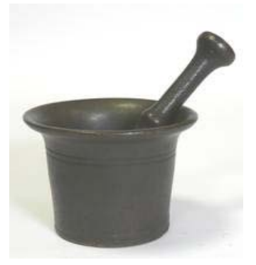
Fig. 1: A mortar: the simplest instrument of mechanical

Chemistry can be divided in many different fields. Electrochemistry and biochemistry are to be mentioned as an example. The beginnings of mechanochemistry can be traced to the start of the 19<sup>th</sup> Century <sup>[1]</sup>. The first studies were conducted by M. Carey Lea and focused on mechanically induced reactions of solids. Lea used a metal halide and processed it with a mortar: separating the metal and halogen. This was the beginning of numerous research activities and thus founded an additional sub field of physical chemistry <sup>[2]</sup>.