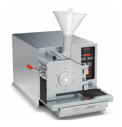
Fig. 6: Universal Cutting Mill PULVERISETTE 19

The performance of the PULVERISETTE 19 is highly reproducible regardless of the end user's individual expertise. Its high-throughput system enables continuous processing one to five pounds of material per minute, on average. The mill is dust-free and easy to clean. Its Cyclone separator also provides effective heat mitigation, preventing resin build-up and maintaining the integrity of the final extract or plant product. The US cannabis industry has rapidly grown from a collection of small start-ups to a collection of vertically integrated, scientifically minded firms.