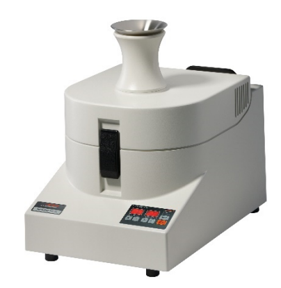
Fig. 4: Variable Speed Rotor Mill 14 PULVERISETTE 14 classic line

All of the contact surfaces are composed of stainless steel — or food-grade plastic vacuum hose for the Cyclone — and are easy to clean thoroughly between batches, reducing the likelihood of cross-batch contamination. A variable-speed motor and a range of sieve rings provide full control over