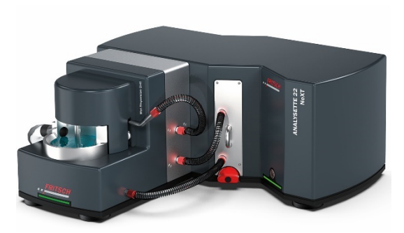
Fig. 1: Laser Particle Sizer ANALYSETTE 22 NeXT

An analytical laboratory also requires particle sizing in their validation of sample preparation. Finally, particle size and crystal shape are important factors in medical cannabis products and CBD isolate manufacturing.