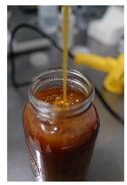
Fig. 7: Cannabis oil

"Our approach remains focused on simplifying the work our customers do, and increasing the efficiency, consistency and quality of those processes," says Fauth. "As in so many other industries, we stay ahead of the cannabis curve by continuing to recognize changing market demands, and to help our customers convert those demands into new opportunities through constructive problem-solving."